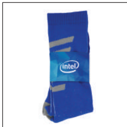
Full Color Wrap