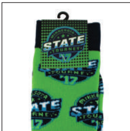
Full Color Hang Tag