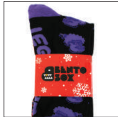
Full Color Wrap