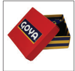
Full Color Sock Box