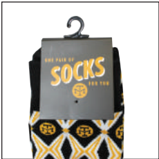
Full Color Hang Tag