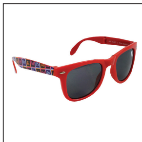
Full Color Printing