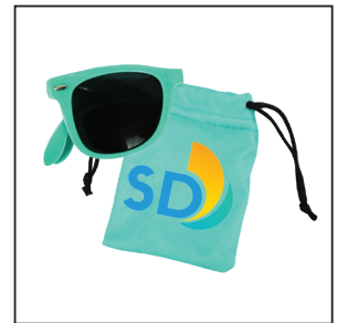
Add Full Color Pouch