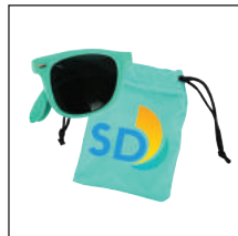
Add Full Color Pouch