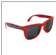
Full Color Printing