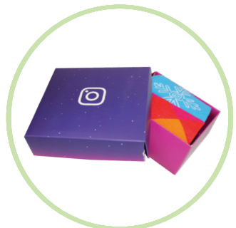
Full Color Sock Box