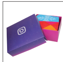
Full-Color Sock Box