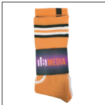
Full-Color Wrap Tag