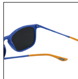
Ear Piece Printing