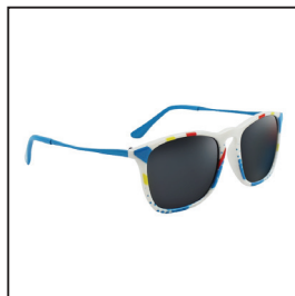
Full-Color Printing on Frame