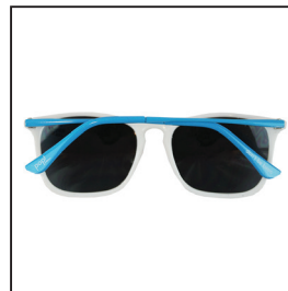
PMS Matched Metal Arms