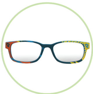
Full Color Frames