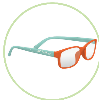
Change Arm Color