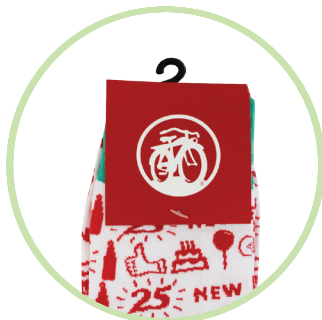
Full Color Hang Tag