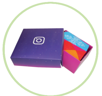
Full Color Sock Box