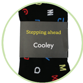
Full Color Wrap Tag